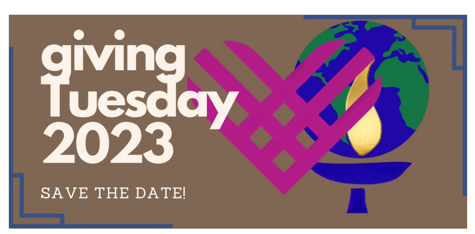
Join Us for GivingTuesday - the Global Day of Giving on Nov 28, 2023

Supporters like you make it possible for us to provide spiritual care for activists and advocates—we couldn't do it without you. I hope you'll join us!