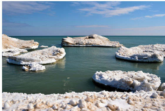
"Ice Formations on Lake Michigan in Winter"