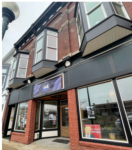
Street view of the North Coast Works Building, 417 Howard Street.

If you're in need of a hug, you can find them here, where we believe that all people are inherently worthy of love. We are a welcoming congregation that celebrates diversity, strives to advance equity, and is all about inclusion. We also serve coffee, and maybe some coffee cake...possibly a bite of chocolate...it's all part of building what Dr. Martin Luther King, Jr., called a "beloved community."