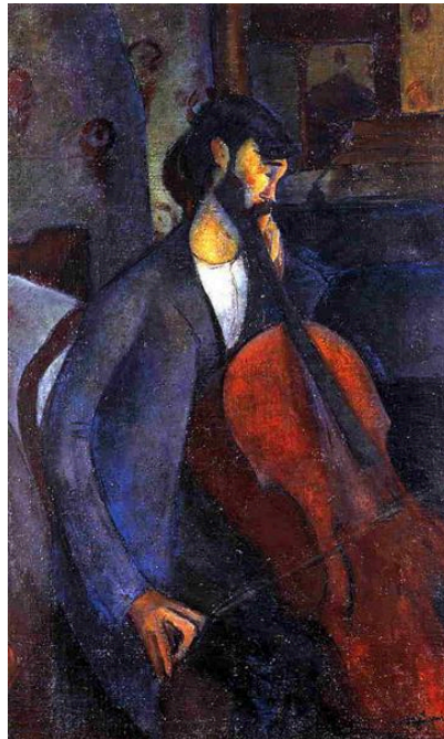
Modigliani, Amedeo. The Cellist. 1909. Oil on canvas. Paris.