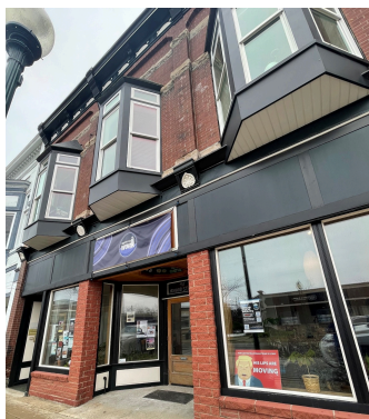
Street view image of 417 Howard Street, Petoskey

Services are held by Zoom and in-person on Sundays at 11:00 AM . Our physical meeting location is North Coast Works Building, 417 Howard Street, Petoskey and will be followed by a social gathering with refreshments.