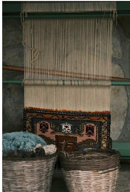
Close-up of a weaving loom.