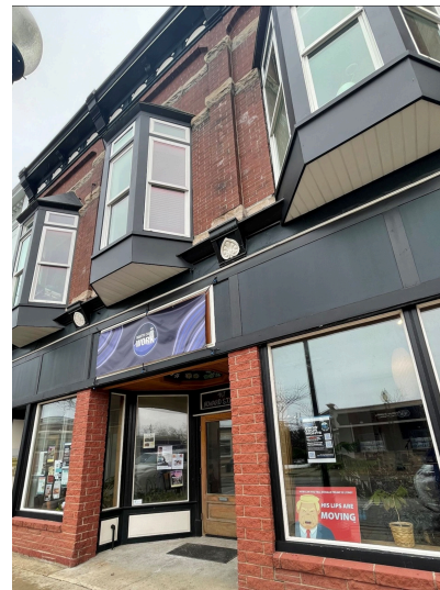
Street view image of 417 Howard Street, Petoskey

Our physical meeting location is North Coast Works Building, 417 Howard Street, Petoskey and will be followed by a social gathering with refreshments.