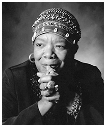
Maya Angelou (1928-2014)