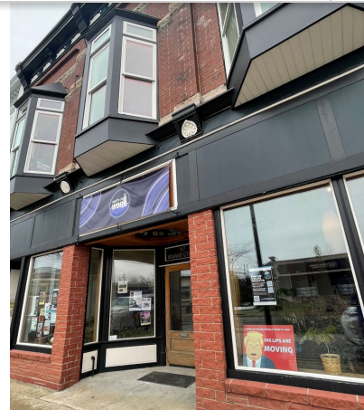
Street view image of 417 Howard Street, Petoskey

Our physical meeting location is North Coast Works Building, 417 Howard Street, Petoskey and will be followed by a social gathering with refreshments.